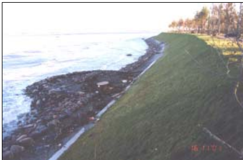
Fig. 8: Graded sandstone cliff at Kakumae. Photo: K. Orviku, November 2001.

At the beach nourishment site in Pirita the coastal erosion continues and slightly increases due to increasing storm wave and surge activity and to increasing deficit of sediments. The beach nourishment efforts at Pirita have been relatively effective in the conditions of limited erosion agents. Till the exceptionally strong storm of November 2001 the beach was relatively stable there. Now the renourishment is needed again, as the beach wasn't naturally replenished afterwards. The strengthening of the coast with boulders is relatively effective in the case of an indented and sheltered study area, however latest investigations show, that it should be even more effective if applied in combination with geotextile. The effectiveness of the cliff cutting at Kakumae is still to be examined. So far it had shown resistance to the wave action during the storm of November 2001 although few places at the beach have been washed off.