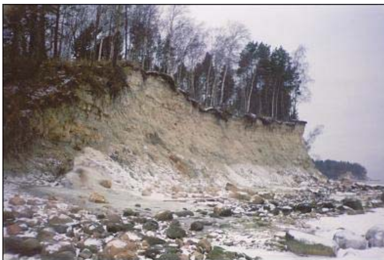
Fig. 6: Eroded sandstone cliff in Kakumae. Photo: R. Povilanskas, December 2002.

Formerly stable sandstone cliffs and moraine bluffs were eroded during the latest extremely severe storm events.