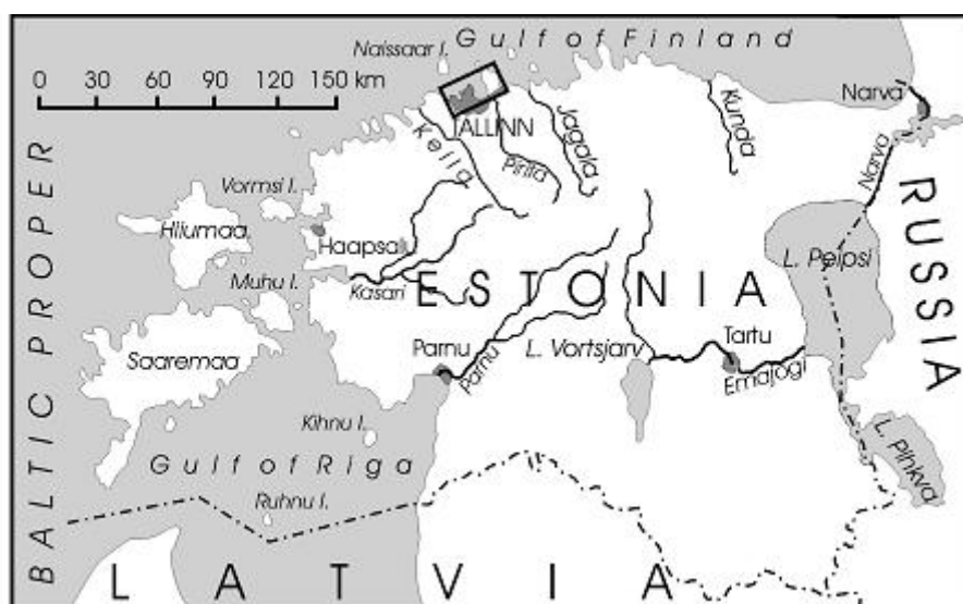
Fig. 1: Location of the case area.

Silty, sandy, gravel, pebble and boulder beaches