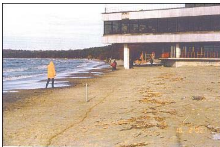
Fig. 4: Recreation facilities on the Pirita beach. Photo: K. Orviku, February 2002.