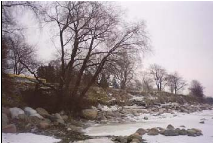
Fig. 3: Eroded moraine bluff at Merivalja – Pirita road. Photo: R. Povilanskas, December 2002.