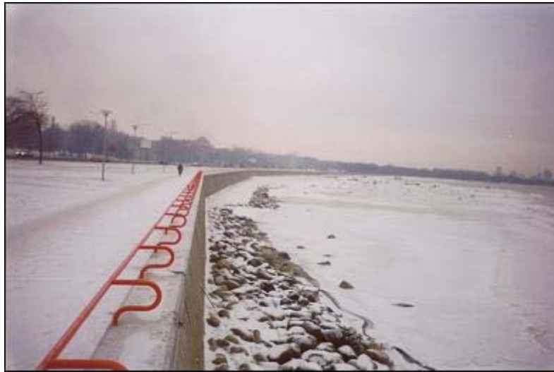
Fig. 7: Coastal seawall along the Tallinn – Pirita road. December 2002.