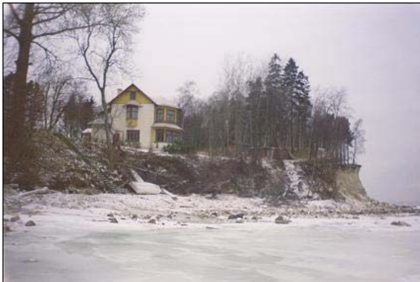
Fig. 5: House threatened by cliff erosion in Kakumae. Photo: R. Povilanskas, December 2002.

Within the study area the increasing erosion currently threatens only the recreational functions of the Pirita beach and the existence of few earlier built houses, which are located too close to the edge of the escarpment (Figure 5). The total capital at risk is ca. 0.4 – 0.6 M. EUR.