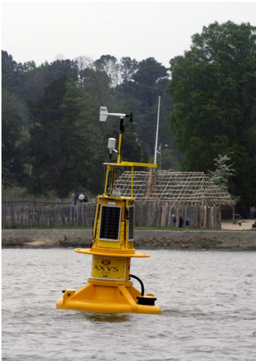
Figure 2: Smart buoy being used in a NOAA project (5) .

Smart sensors enhance the scope for monitoring and may record many of the variables conventionally measured in the marine environment including: temperature, pH, salinity, chlorophyll, nitrate, dissolved oxygen, etc. and weather conditions, e.g. wave high, wind, etc.