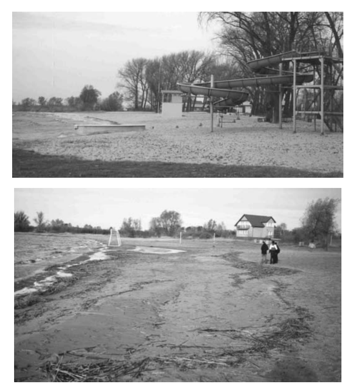
Fig. 3: Public beach in Luczyna in the Jezioro Dabie near Szczecin as well as in Stepnica close to the Odra river mouth. Refering to our results, summer tourists are subject to a serious virus infection risk in both locations.

Our results clearly show that all beaches north of Szczecin along the river Odra as well as in the river mouth have a potentially high virus infection risk. Examples are shown in Fig. 3. The fast virus decay suggests, that smaller pollutants like cities along the coast of the lagoon might be of higher importance than a heavy but more distant pollutant like the city of Szczecin. During the last decade new sewage treatment plants on the German side of the lagoon improved the released sewage water quality and decreased the risk of high virus release into the Kleines Haff. Recently new sewage plants with high capacity were established on the Polish side in Swinoujscie and Miedzyzdroje, too. Altogether, the adjacent towns nowadays have to be regarded as less important sources for viruses. Despite this, a local virus release never can be excluded.